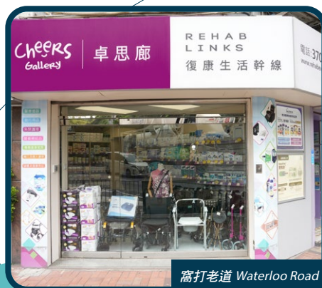
高打老道 Waterloo Road