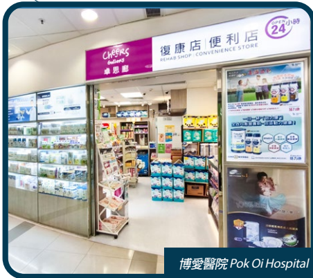
博愛醫院 Pok Oi Hospital