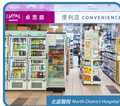
北區醫院 North District Hospital