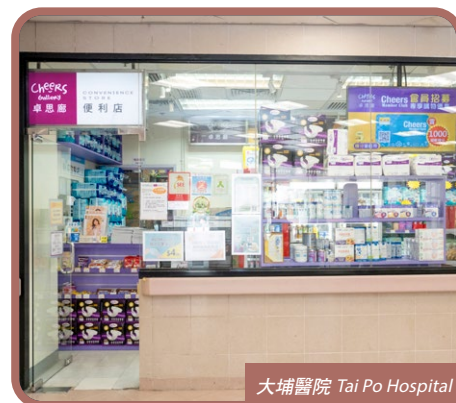
大埔醫院 Tai Po Hospital