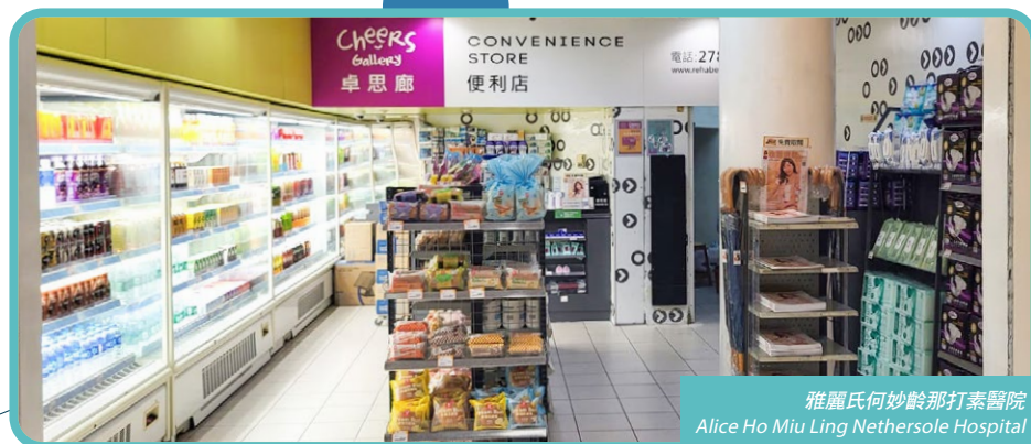
雅麗氏何妙齡那打素醫院 Alice Ho Miu Ling Nethersole Hospital