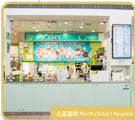
北區醫院 North District Hospital