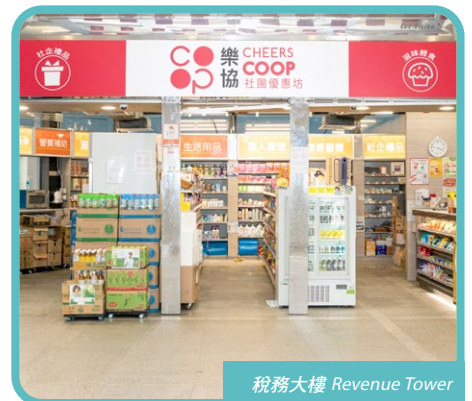
稅務大樓 Revenue Tower