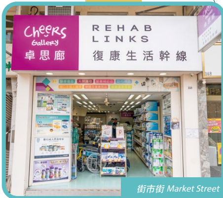
街市街 Market Street