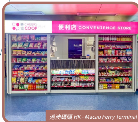
港澳碼頭 HK - Macau Ferry Terminal