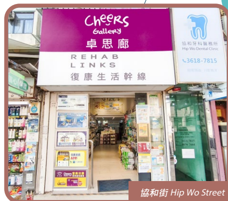
協和街 Hip Wo Street