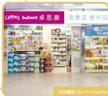
沙田醫院 Sha Tin Hospital