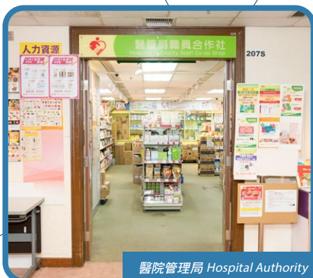
醫院管理局 Hospital Authority