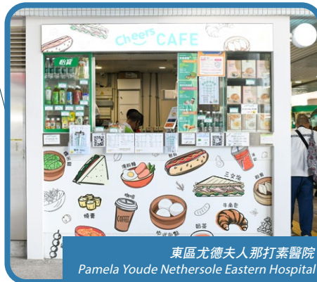
東區尤德夫人那打素醫院 Pamela Youde Nethersole Eastern Hospital