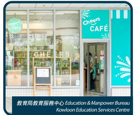
教育局教育服務中心 Education & Manpower Bureau Kowloon Education Services Centre