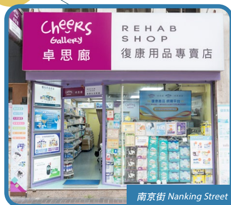
南京街 Nanking Street