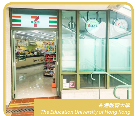
香港教育大學 The Education University of Hong Kong