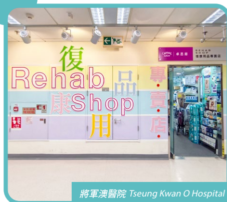
將軍澳醫院 Tseung Kwan O Hospital