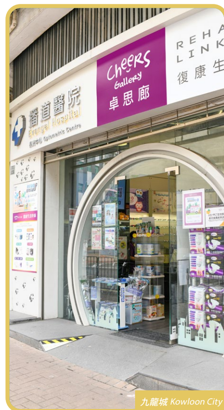
九龍城 Kowloon City