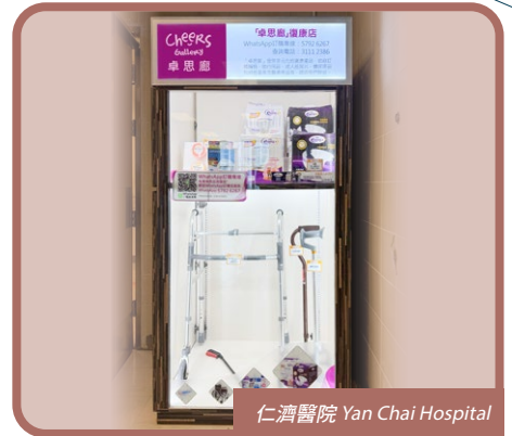
仁濟醫院 Yan Chai Hospital