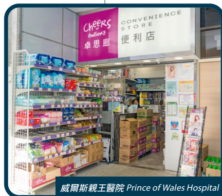
威爾斯親王醫院 Prince of Wales Hospital