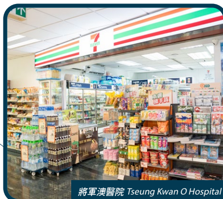
將軍澳醫院 Tseung Kwan O Hospital