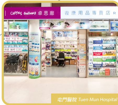
屯門醫院 Tuen Mun Hospital